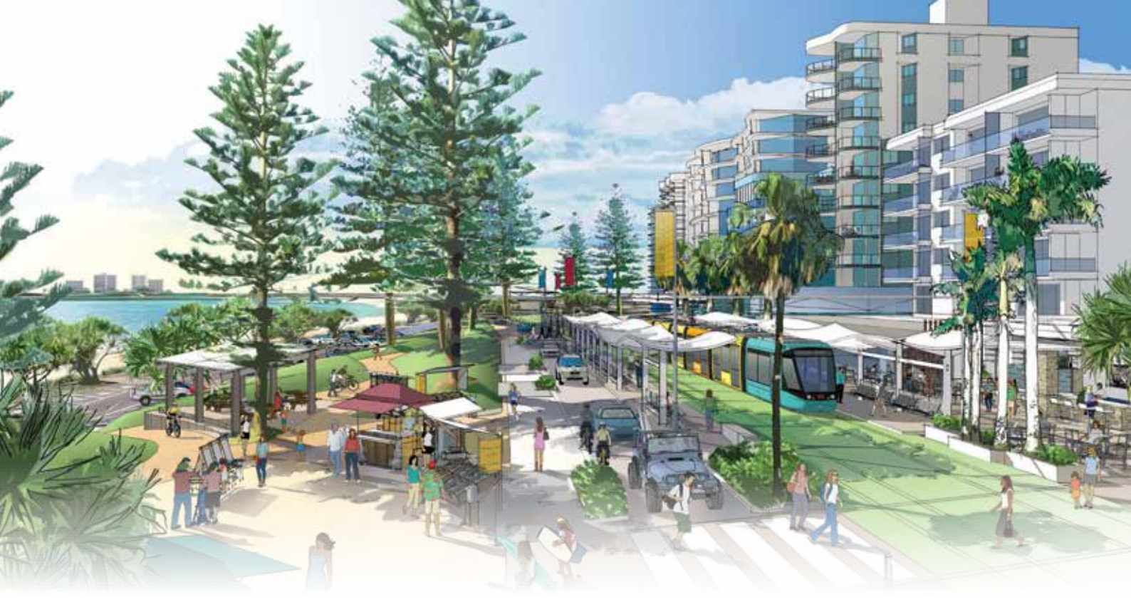
Light Rail Shot